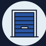
Pedestrian Access Industrial Doors