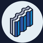
Steel Cladding Sandwich Panel