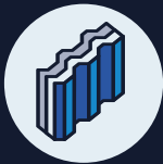
Steel Cladding Sandwich Panel