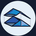
PVC Roof PVC Insulated Roof