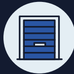
Pedestrian Access Industrial Doors