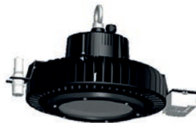
Daylight and/or Motion Detectors